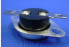
Type 11EN / 11ES

1/2" Bimetallic Disc Thermostat Automatic Reset / Phenolic Case / Low Profile 11S: 125 VAC/ 6A, 250VAC/ 2A 11N: 125 VAC/ 15A, 250VAC/ 10A Standard: UL-E43273, CSA-LR67166